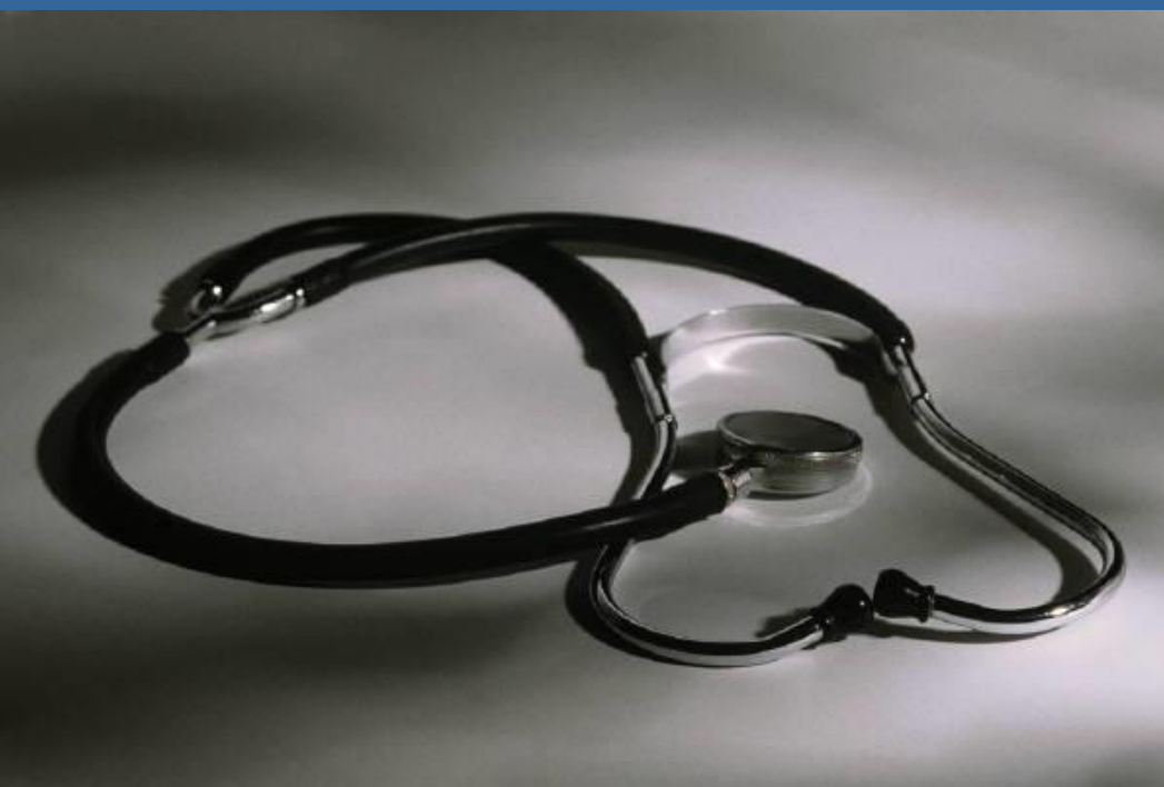
Figure 3. Label in 24pt Arial.