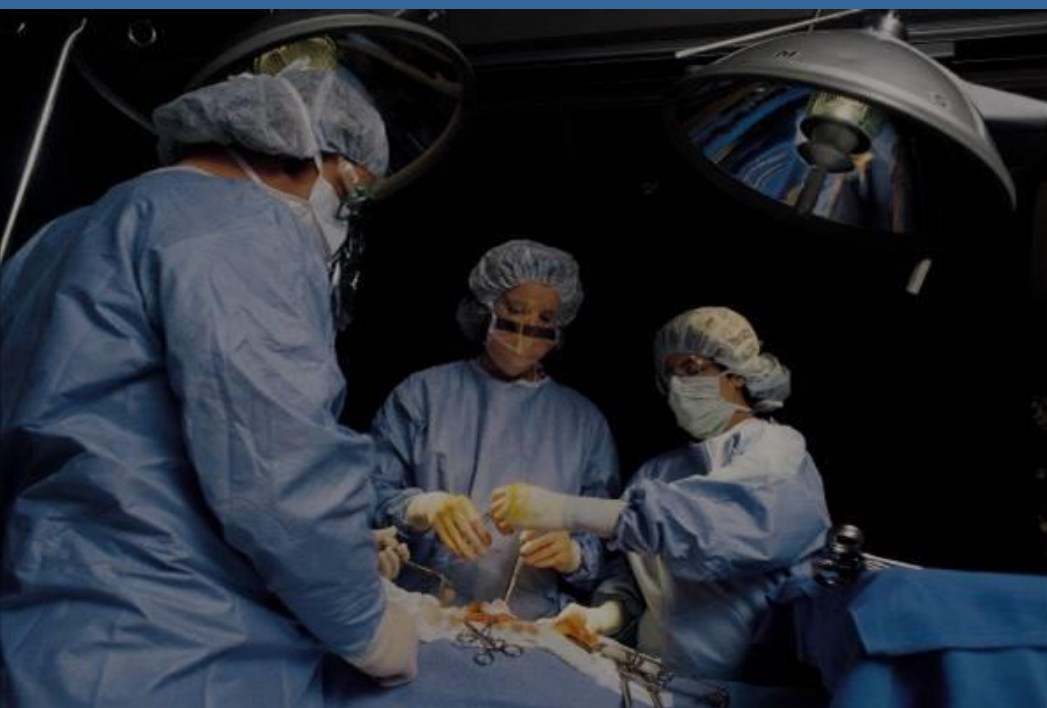
Figure 2. Label in 24pt Arial.